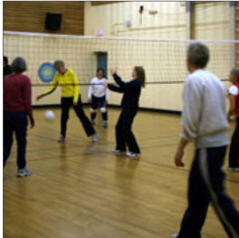
Community volleyball at the league hall