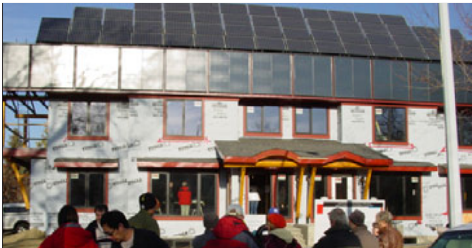
Alternative-energy buffs flock to the Riverdale NetZero open house in November.